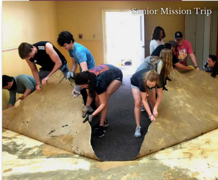
Senior Mission Trip

“Each one should use whatever gift he has received to serve others, faithfully administering God’s grace in its various forms.” 1 Peter 4:10