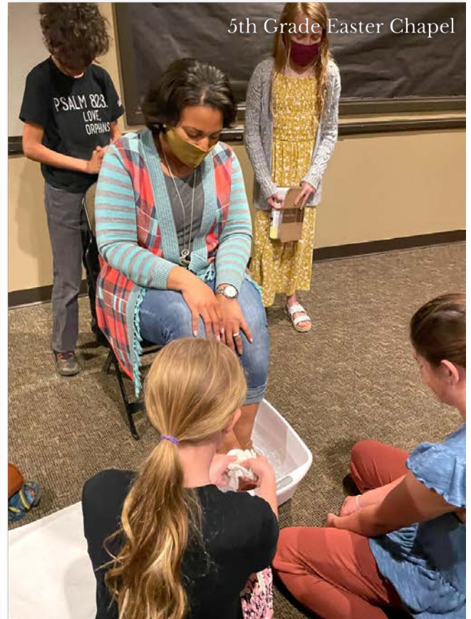
5th Grade Easter Chapel