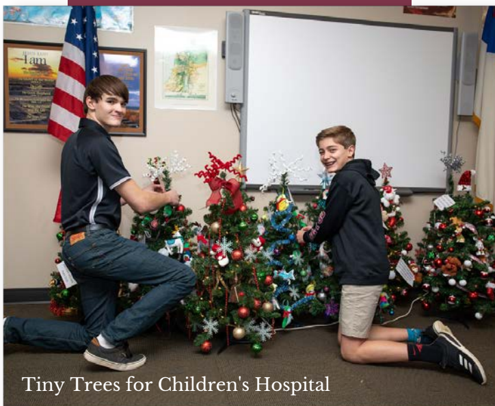
Tiny Trees for Children's Hospital