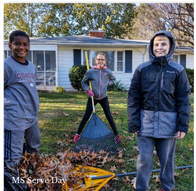
MS Serve Day